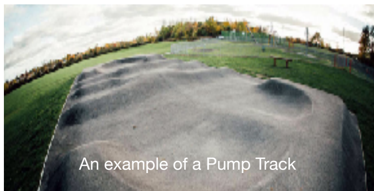
An example of a Pump Track

It is envisaged that children will use the Pump Track on skateboards, scooters, bikes and other wheeled kit. The climbing blocks are of different heights and suit children of all ages. The old climbing frame close to the Waggonway will be replaced with Climbing Blocks, funded by a £7,000 grant from the Masons last year. We hope that the new equipment will be in place in time for the Summer Fair on Saturday 23 rd June.