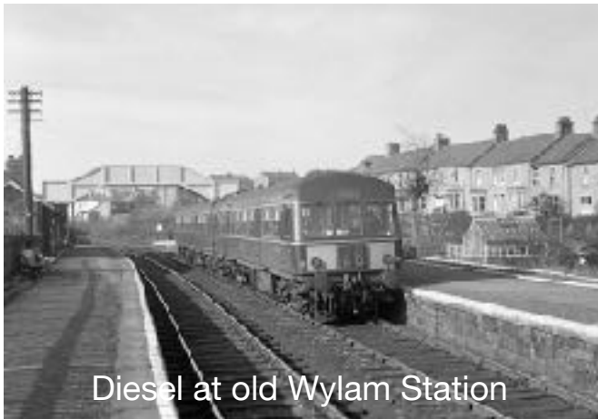
Diesel at old Wylam Station

As part of the WPPF we are also starting an oral history project to gather memories and we hope, related photos or memorabilia, based around the closure of North Wylam Station 50 years ago, in March 1968. We held a small gathering on the site of the old station on 28 March 2018 to commemorate the closure and had coverage in the Hexham Courant – search on the internet for ‘Railway memories of the North Wylam Loop’ for text and photos.