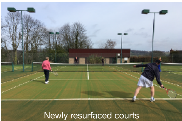
Newly resurfaced courts