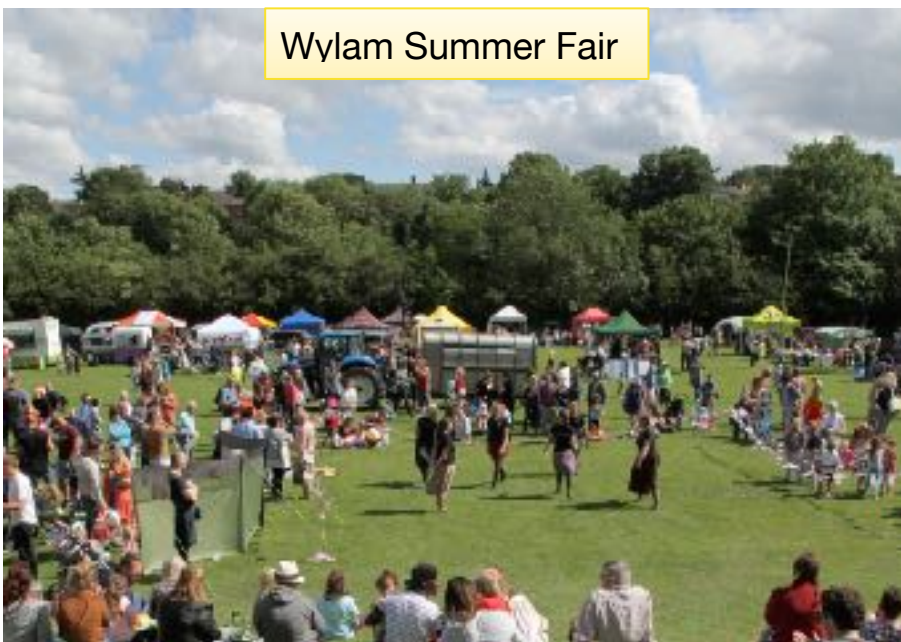
Wylam Summer Fair

Out on the fields, the Beer Hall Heroes will be digging in for a tough tug of war against all comers. Come and have a go if you think you have the muscle (or weight!) to beat them.