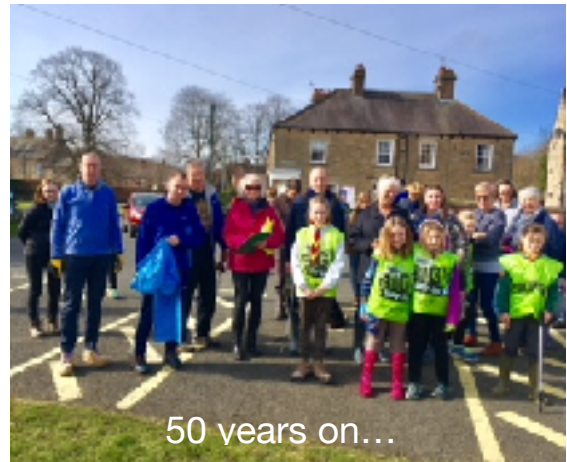
50 years on...